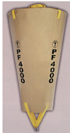
Professional 4000 Lift Bag